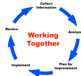
SPC Cycle for Improvement